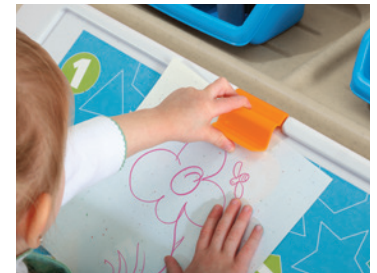
Design and colors may vary